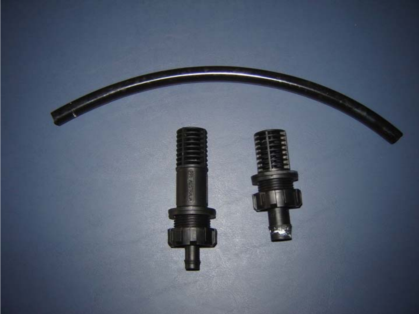
1/2" rubber hose